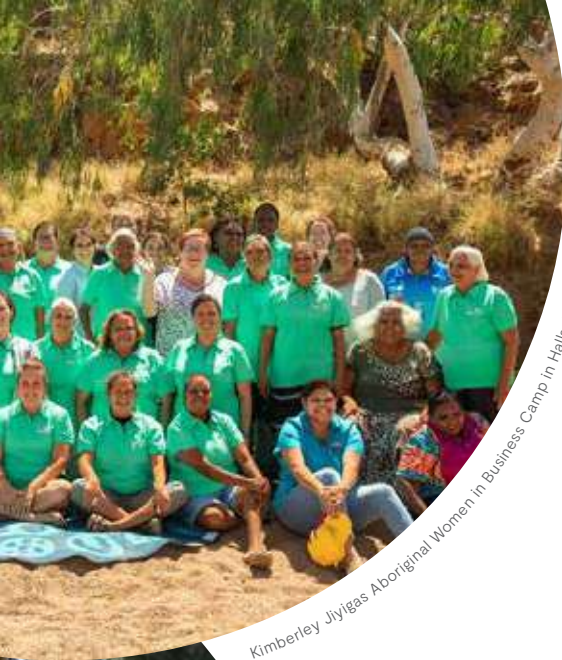
Kimberley Jiyigas Aboriginal Women in Business Camp in Halls Creek