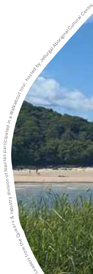
Leaders from the Careers & Industry division of Navitas participated in a Walkabout tour, hosted by Jellurgal Aboriginal Cultural Centre.